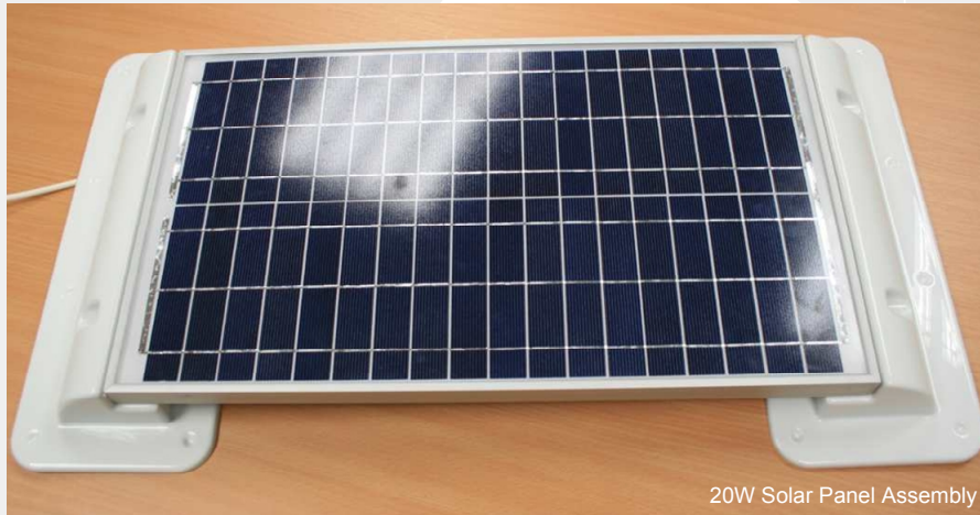
20W Solar Panel Assembly