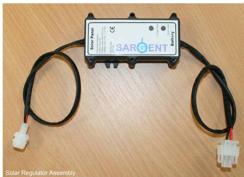
Solar Regulator Assembly

Contact details. Sargent Electrical Services Limited provide a technical helpline during office hours. Please contact 01482 678981 if you require technical help. For out of hours support please refer to the tech support and product assistance sections of the Sargent web site www.sargenttd.co.uk