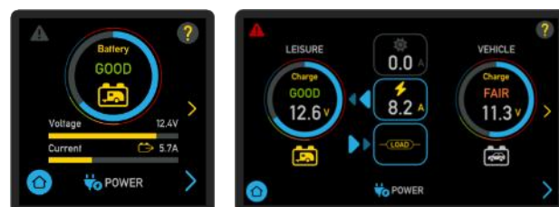
Example Power screens for EC940 & EC970